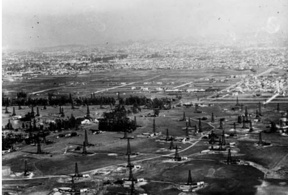
Wilshire District, Oil Fields, 1924

L os Angeles of the mid-1800s was very different from the Los Angeles that you know today. It was a dusty cow town, populated mostly by ranchers who raised cattle. They sent their beef up north via the railroad to feed the thousands of people who had flooded into California after the Gold Rush of 1848.