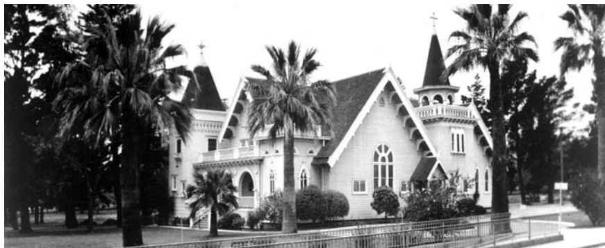
Wadsworth Chapel

This is the oldest building on Wilshire. It’s a chapel – a place for people to pray and worship. When it was built in 1900, the architects designed it to have two chapels inside. One side is a Catholic chapel, and the other side is Protestant. If you look closely, you can see two kinds of windows on the chapel. Some are Romanesque, with rounded arches. Others are Gothic, with more pointed arches.